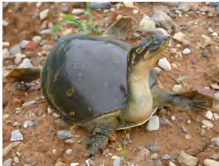
Fig. 2F. Indian Flapshell Turtle Lissemys punctata .